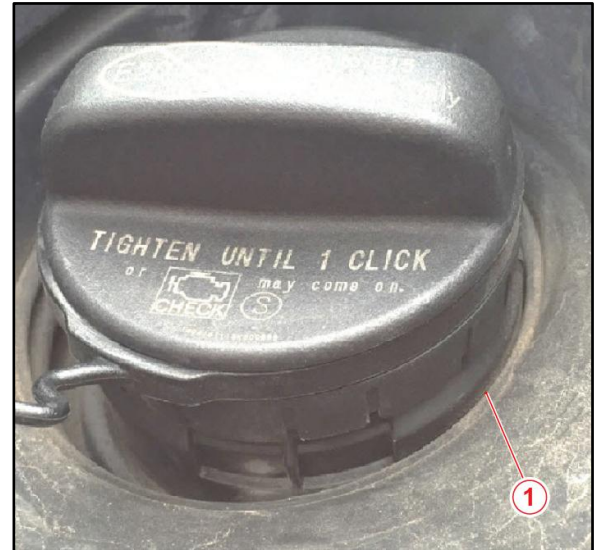
Figure 7. OK Condition