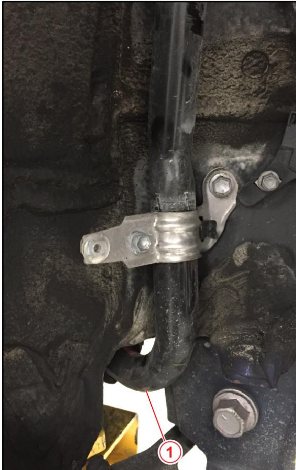
Figure 5. Bottom Joint