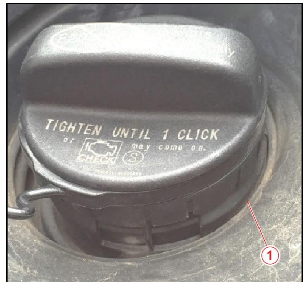
Figure 2. OK Condition