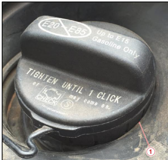
Figure 1. NG Condition