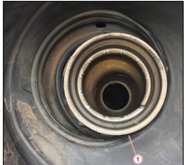
Figure 6. Fuel Neck Opening